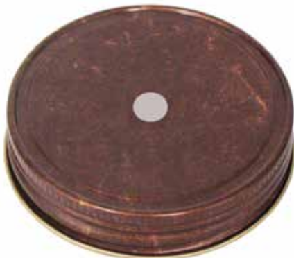
10mm Center Perforation