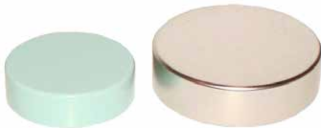
44 High & 58 High