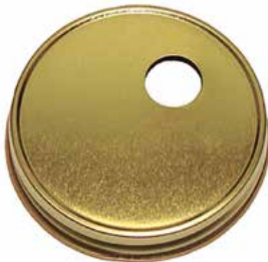
3/8" & 5/8" Offset Perforations